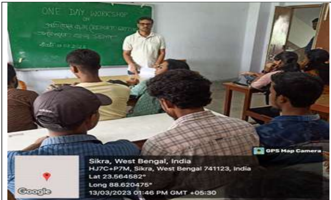
Photo Graph of Soft Skill Classes (Language and Communication Skills) by Bengali department of Govt. Gen. Degree College Chapra

5.1.2: Report with photographs on Programmes /activities conducted to enhance soft skills, Language and communication skills, and Life skills