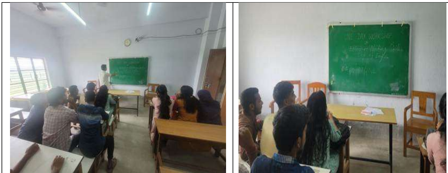
Photo Graph of Soft Skill Classes (Language and Communication Skills) by English department of Govt. Gen. Degree College Chapra

Govt. Gen. Degree College Chapra has demonstrated commendable efforts in enhancing language and communication skills among its students, contributing to their overall development and employability. The college recognizes the significance of effective communication in today's globalized world. Various initiatives have been implemented, including debate competitions, and public speaking forums, to foster proficiency in verbal and written expression. Additionally, the college has integrated language modules across disciplines to promote interdisciplinary communication. The faculty members actively engage in mentoring and guiding students to improve their language skills. Govt. Gen. Degree College Chapra's consistent focus on language and communication skills has equipped students with the ability to articulate their ideas effectively, boosting their confidence and preparing them for successful careers.