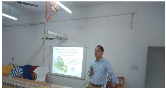
HJ7C+P7M, Sikra, West Bengal 741123, India Sikra West Bengal India 29°C 84°F 2022-12-02(Fri) 01:01(pm)