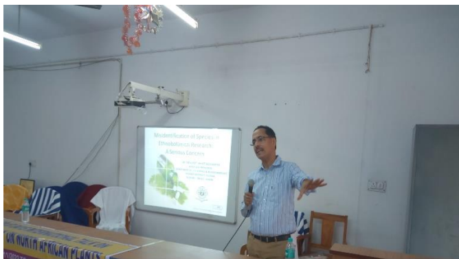
Jayghata, West Bengal, India Jayghata West Bengal India 29°C 84°F 2022-12-02(Fri) 01:01(pm)