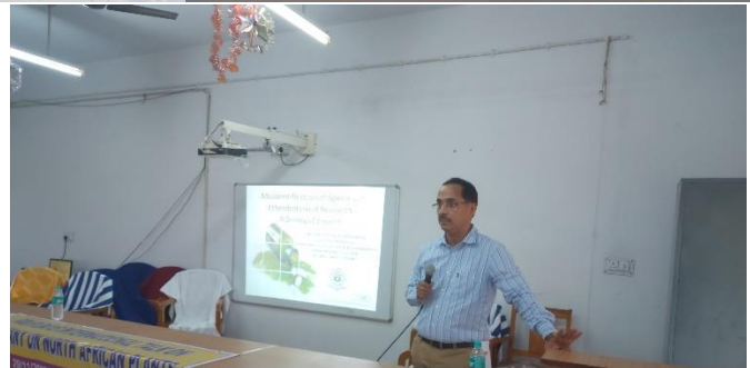
Jayghata, West Bengal, India Jayghata West Bengal India 29°C 84°F 2022-12-02(Fri) 01:01(pm)