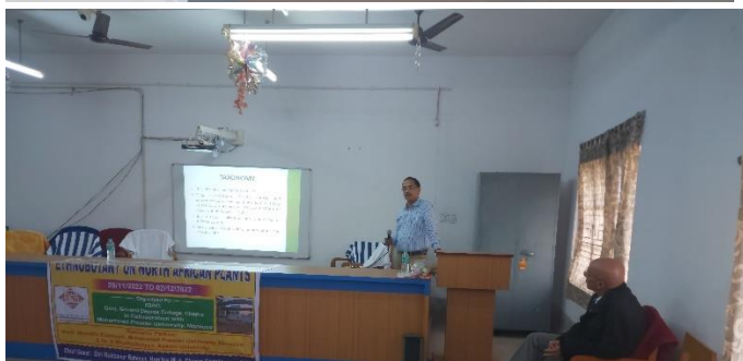
HJ7C+P7M, Sikra, West Bengal 741123, India Sikra West Bengal India 29°C 84°F 2022-12-02(Fri) 01:04(pm)